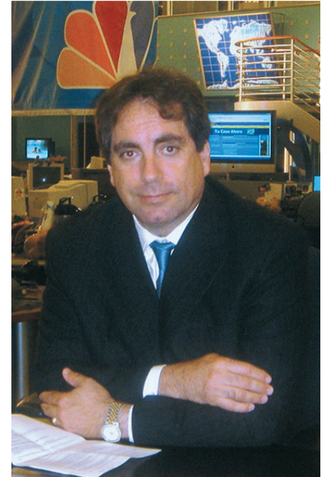
Melamed says it is easy for mobiles to trigger bombs

A mobile phone was used in the July 2002 bombing at a cafeteria at Hebrew University in Jerusalem that killed seven people. In the Bali bombings in October 2002 that killed 202 people, Jemaah Islamiyah terrorists triggered a bomb in a mini-bus outside the