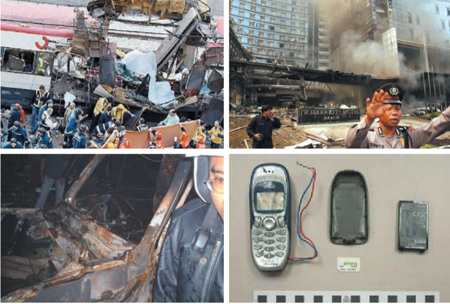
A world of terror, clockwise from bottom left: Bali; Madrid; Jakarta; representation of Madrid mobile phone trigger

Mobile handsets are in the hands of millions of people around the world. And increasingly, of course, in the hands of terrorists