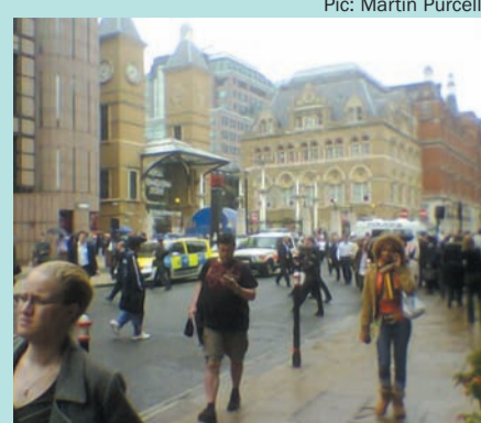
News networks now rely on ground-level reporting

"Transport for London and the Mayor must